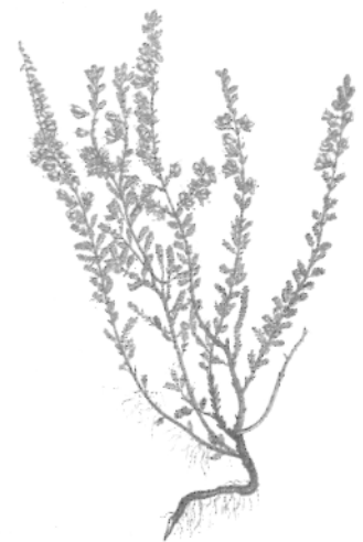
Ling has leaves that grow in four rows along its woody stem. The flowers are small and pink