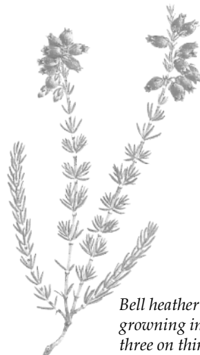
Bell heather has leaves growing in groups of three on thin woody stems the flowers are a purple-red colour.