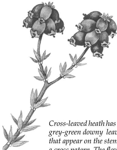
Cross-leaved heath has grey-green downy leaves that appear on the stem in a cross pattern. The flowers are pale pink.

Ling and Bell Heather prefer dry soil while the paler grey-green Cross-leaved heath will thrive in wetter areas.